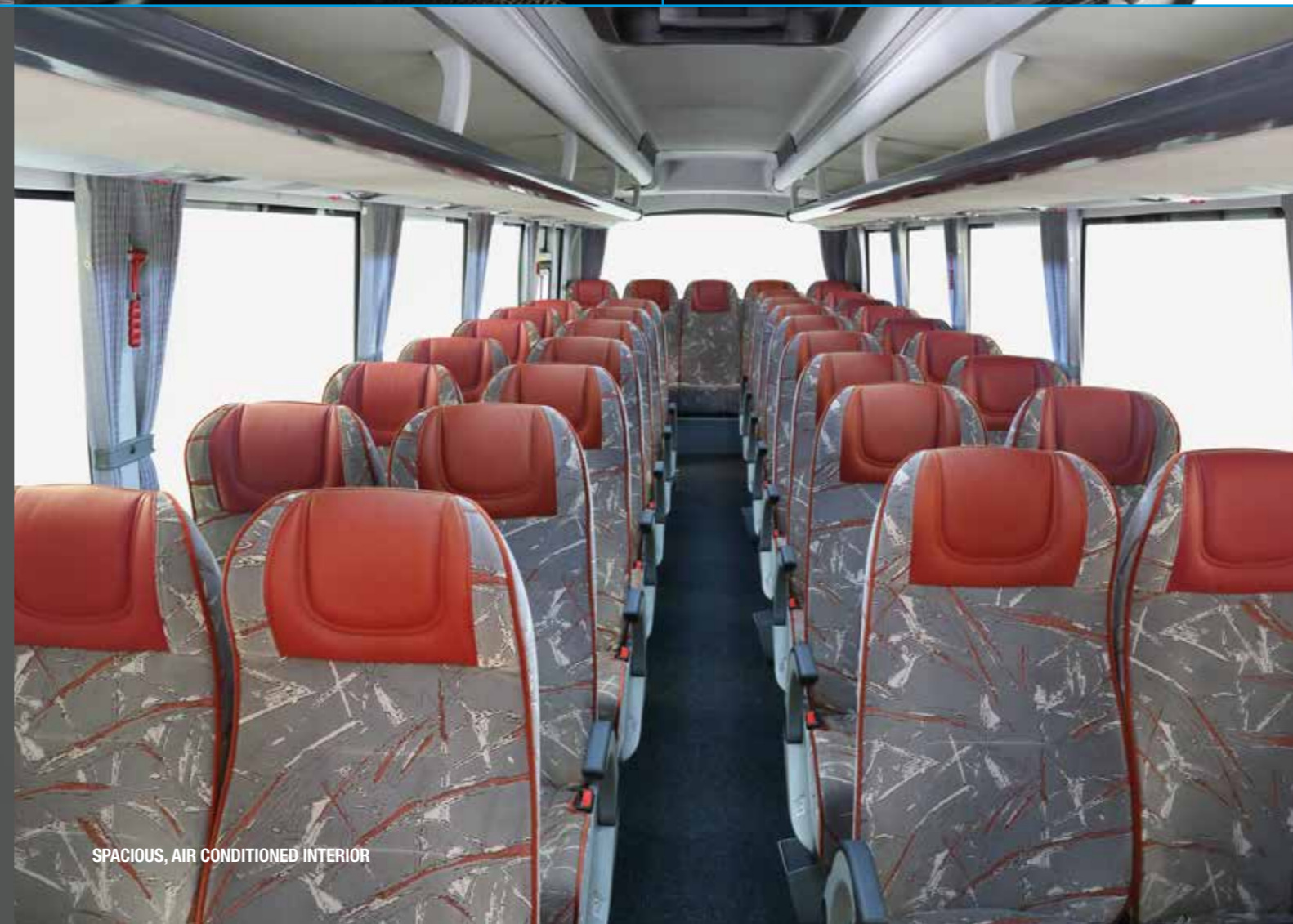
SPACIOUS, AIR CONDITIONED INTERIOR