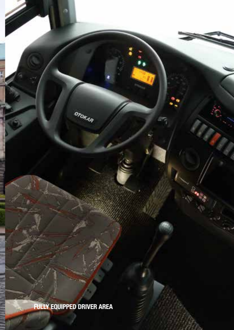
FULLY EQUIPPED DRIVER AREA