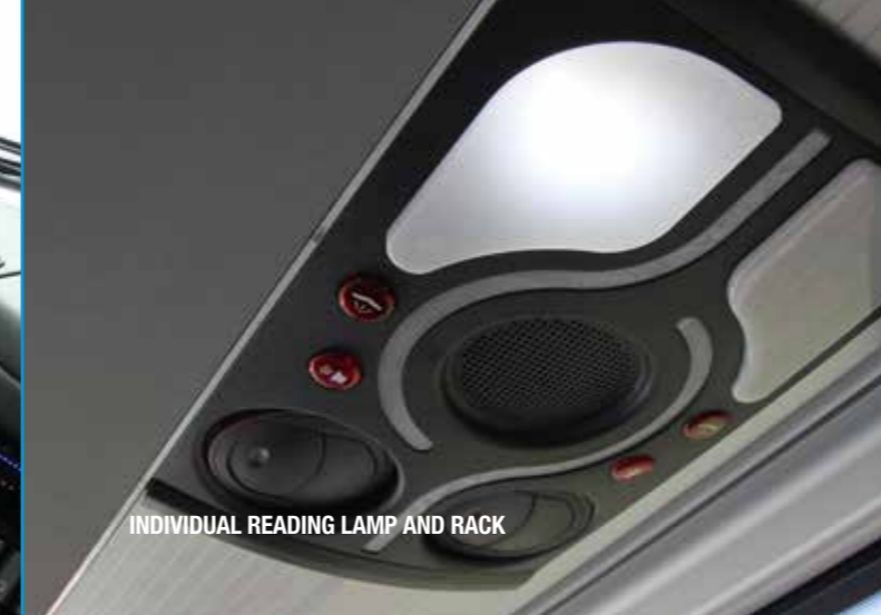
INDIVIDUAL READING LAMP AND RACK