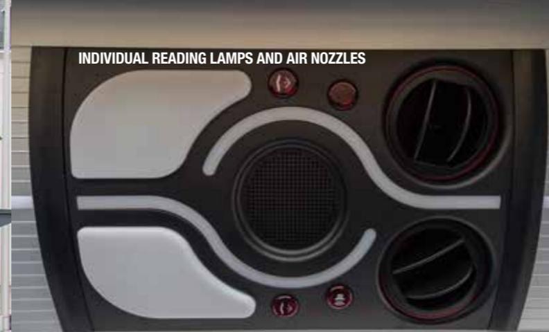
INDIVIDUAL READING LAMPS AND AIR NOZZLES