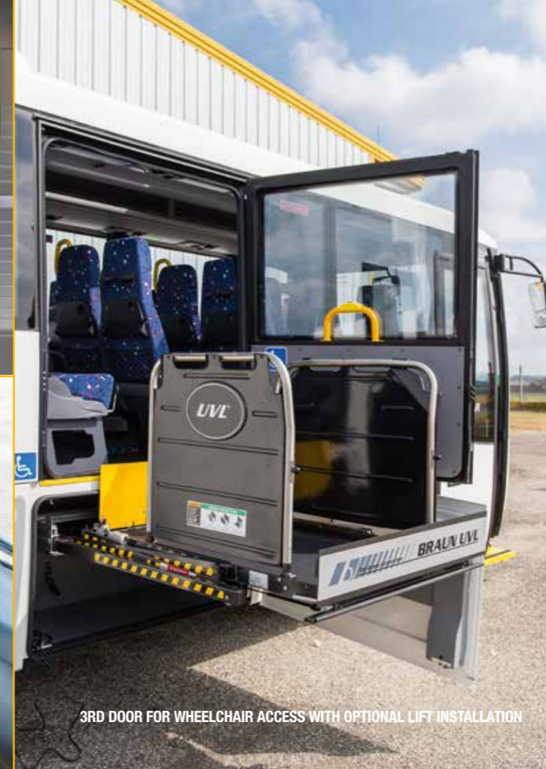
3RD DOOR FOR WHEELCHAIR ACCESS WITH OPTIONAL LIFT INSTALLATION