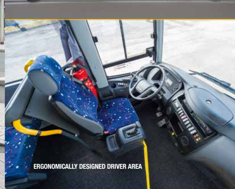
ERGONOMICALLY DESIGNED DRIVER AREA