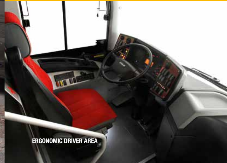
ERGONOMIC DRIVER AREA