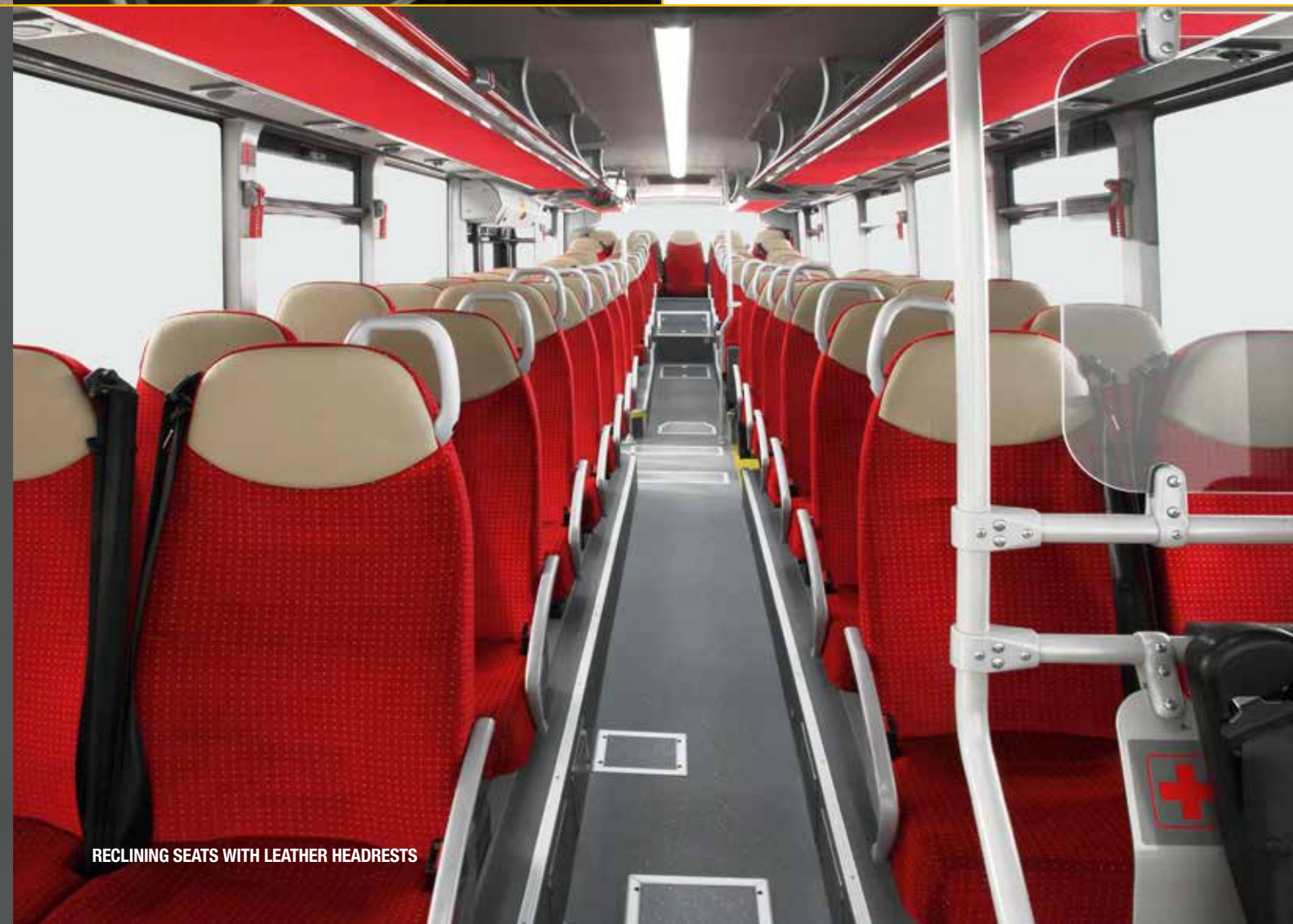
RECLINING SEATS WITH LEATHER HEADRESTS