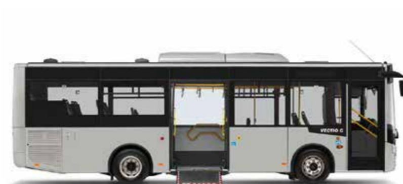
LOW ENTRY, DOUBLE MIDDLE DOOR AND WHEELCHAIR RAMP FOR EASY ACCESS