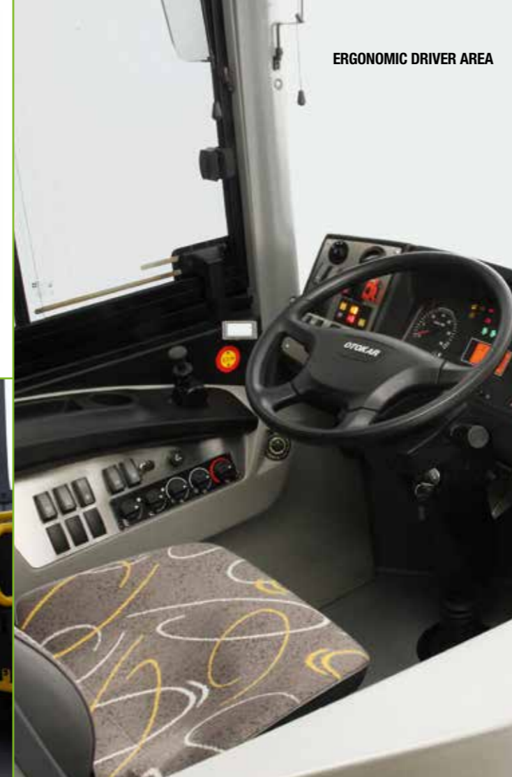
ERGONOMIC DRIVER AREA