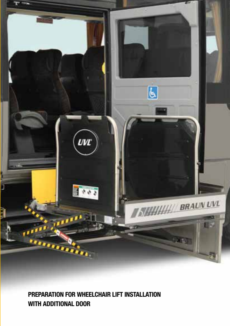
PREPARATION FOR WHEELCHAIR LIFT INSTALLATION WITH ADDITIONAL DOOR