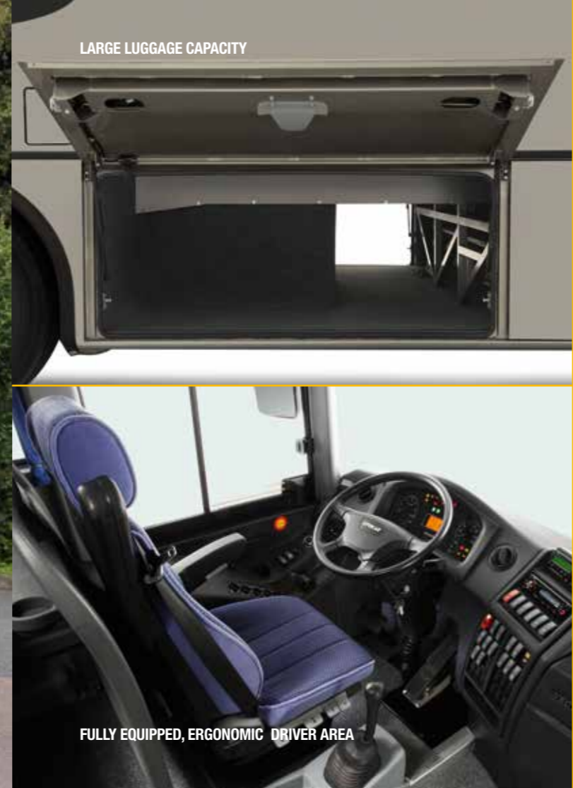
LARGE LUGGAGE CAPACITY