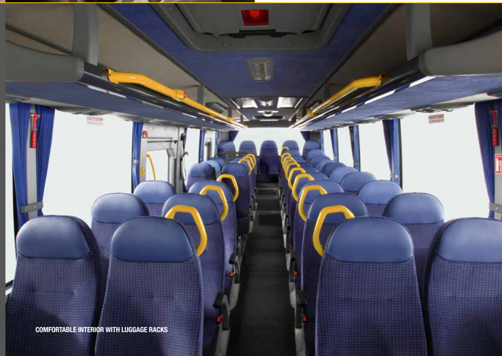
COMFORTABLE INTERIOR WITH LUGGAGE RACKS