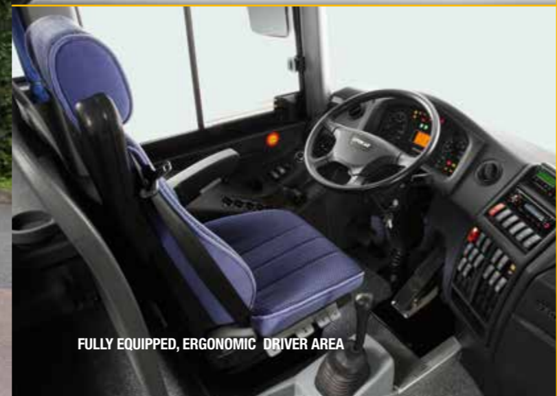
FULLY EQUIPPED, ERGONOMIC DRIVER AREA